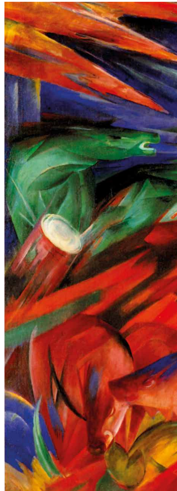
'Animal Destiny' by Franz Marc – 195 x 263 cm 'Animal Destiny' is the title of the 1913 work by the expressionist painter who died during the First World War. The name was given to it by his friend and colleague Wassily Kandinsky. In 1916 the painting fell victim to a fire in a warehouse and destroyed a third of it. Paul Klee restored it in 1926 from original water colour sketches of 1913 and 1914.

While the other animals react with panic, inquisitiveness or resignation only the roe deer seems completely at peace with the situation. It stretches its neck in the direction of the falling tree, stretches it so far as to be unrealistic in length, its entire body appears to follow this stretching. Such a situation would suggest the roe deer to be the first of the animals to perish. In the painting however it is the only one that survives. For it is not so deeply bound into the colours and forms of the picture but is there out of its own movement. A movement under its own control, a movement of active self-sacrifice. Along with this are the two colours, the radiant blue and especially the glistening white, which stand out in the painting and are not sucked into the inferno. The animals clearly face two extreme possibilities – either complete dissolution or an ego-like spiritual survival. A spiritual element appears within the untarnished whiteness of the roe deer that is lifted out from the colours of soul and which bestows on the animal a kind of individuality that will no longer face dissolution by elemental forces. Why the roe deer and why this particular roe deer should have this characteristic remains a mystery of Franz Marc. Perhaps because it lived under his protection?