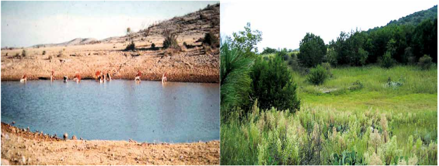
It seems contradictory, but by judicious grazing the desert can be greened.

something wasn't quite right and that's why you counted and if you sensed it today then it has also been missing since today". And so it was. We found the kid in the evening full of life in one of the many holes of that karst landscape. For the flock master it was the most natural thing in the world to have this sensitivity but for me it was a new experience and one that I knew to be true.