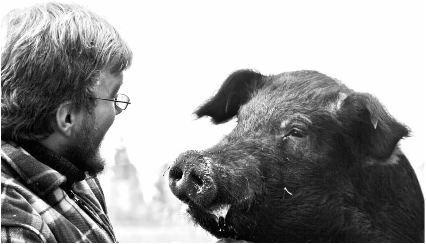
Encounter between human and pig on the Dottenfelderhof.